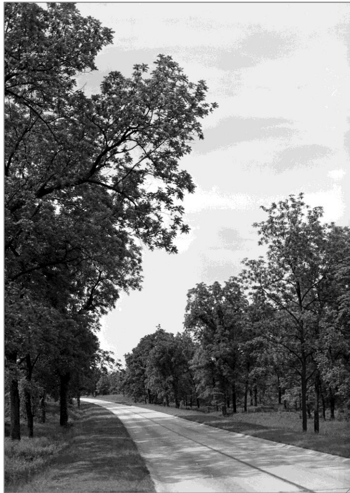
Figure 5: Cape Rock Road, Cape Girardeau County

Rock Road, a road curving through the limestone of southeast Missouri to a park overlooking the Mississippi River, which commemorates Jean Baptiste de Girardot and the trading post he established in 1733. 9 This trading post is considered the starting point of the community of Cape Girardeau.