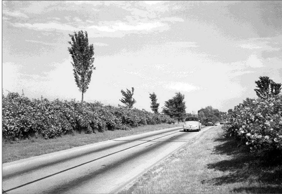
Figure 6: Highway 61 between Cape Girardeau and Jackson, "The Way of the Roses"