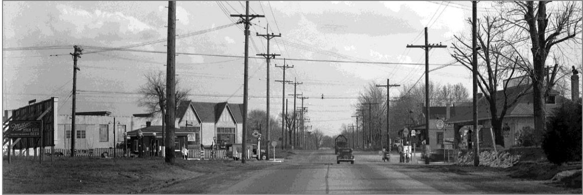
Figure 4: Cluttered roadsides entering a community were to be beautified

Springfield was the first city in Missouri to start a general program of highway beautification 5 ; it would not be the last. Other cities and counties across the state banded together to improve their stretches of road.