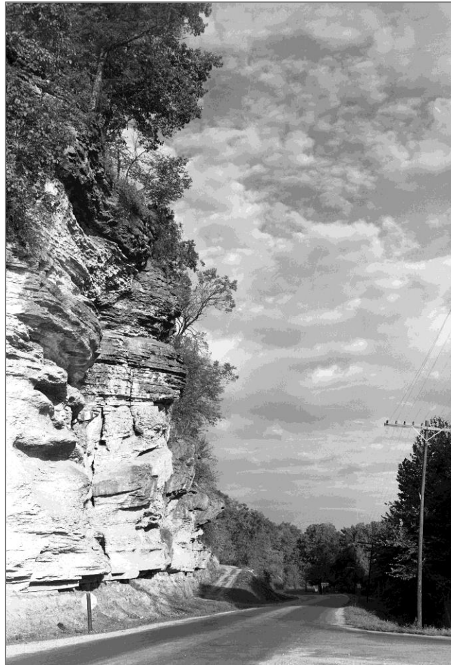
Figure 19: Missouri Roadside, 1938

Missouri roadways had a certain scenic beauty even before an effort was made to beautify them. This was inevitable given the terrain of the state. The State Highway Department, working with federal, state and local agencies, worked to enhance the natural beauty of the state to improve the driving experience for Missourians and those who visited Missouri by car. They were able to take advantage of federal funds available during the depression years, and an abundance of available labor, to create beautiful roadsides. Looking at the roadside, we are still able to enjoy many of their efforts.