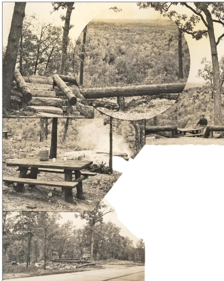
Figure 18: Mockup for Missouri State Fair Display showing Roadside Park Features, ca. 1936 f

Rustic” would become associated with New Deal Era programs. 37 Missouri’s 1930s roadside parks are no exceptions to that rule. The parks exhibit rustic influences through their use of undressed wood for fences, picnic tables and some benches, and uncoursed stone for fireplaces and walls. The Highway Department had several standard designs for fences and walls for the roadside parks, as well as two options for fireplaces. 38 Each of these early parks also had a north arrow and an elevation marker. 39