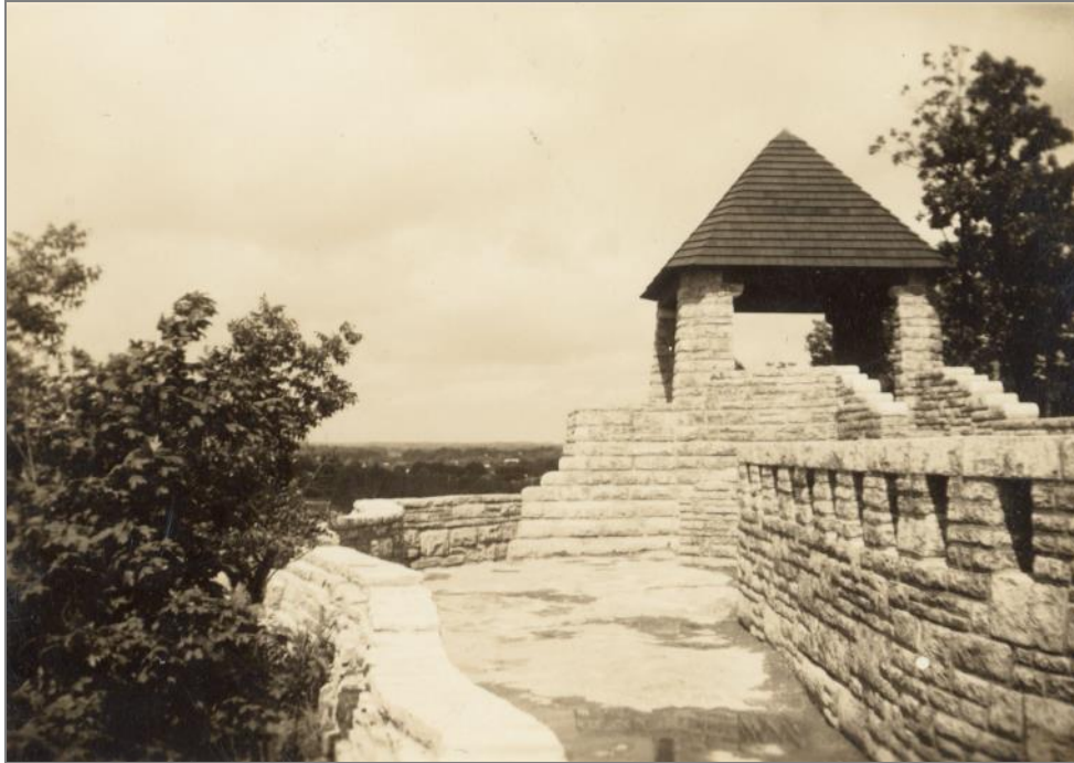
Figure 8: Jensen's Point overlook b