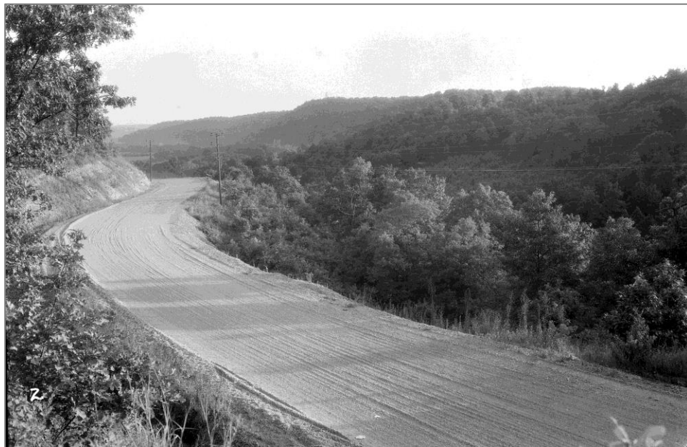
Figure 2: Missouri Roadside, ca. 1926