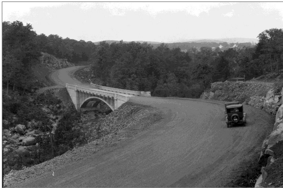
Figure 11: Route 70 at Stouts Creek Gap, 1929

Efforts to improve the roadside did not stop with planting trees and flowers. In 1928 the highway department relocated highway 70 between Ironton and Fredericktown and constructed a new bridge over Stout's Creek. 20 Highway 70 (now 72) was the major route into the Arcadia Valley from the St. Louis region, and tourism was a major industry in the Arcadia Valley. Lake Killarney had been developed in 1908, and there was a summer community at the Lake. 21 There are numerous religious assemblies in Arcadia, which provided summer retreats for city congregants. In 1928 the Ozarks Chamber of Commerce intended to issue 10,000 tourist guides to the attractions in the valley. 22