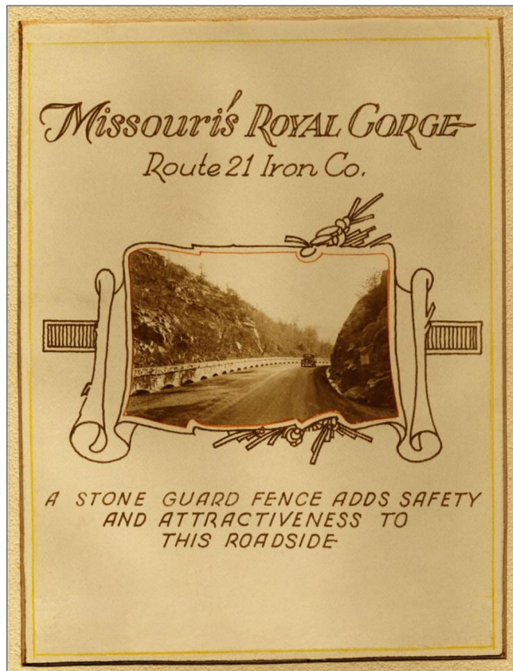
Figure 13: Missouri State Fair Display, ca. 1934 d

area, and were used on postcards promoting the area and in State Highway Department publications showing roadside beautification efforts.