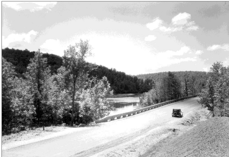
Figure 12: Route 70 along Lake Killarney, 1931

In discussions between the community and the Highway Department, it was decided that a stone wall would be constructed along the highway adjacent to the Lake. 24 The Arcadia Valley is known for its granite, and had skilled workmen to construct the wall. A local quarry supplied the materials at a discounted rate, and local stonemasons contracted with the state to build the wall. 25