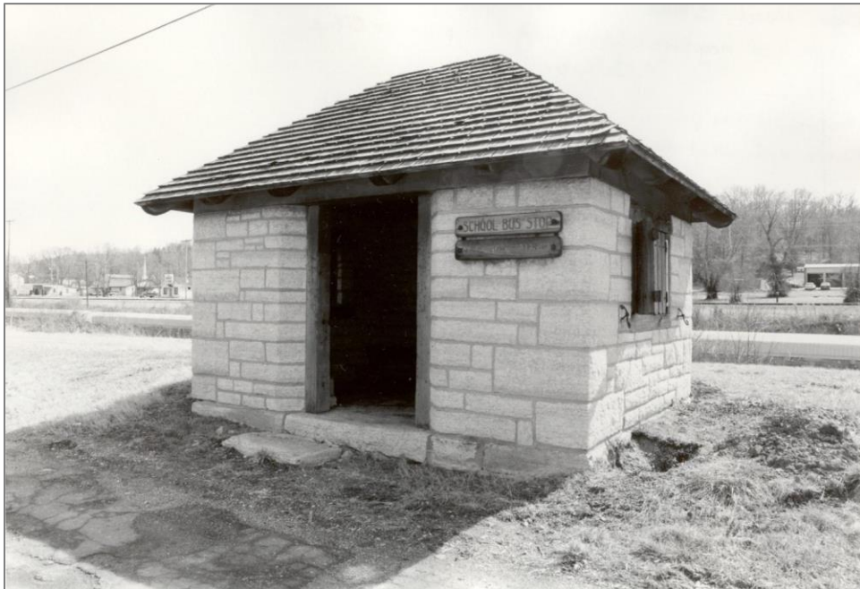
Figure 9: Henry Shaw Gardenway Bus Stop, 2002 c