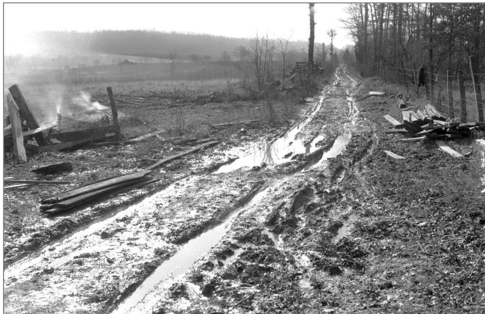
Figure 1: Missouri Roadway, ca. 1923 a

In the 1910s and early 1920s, the early years of the Missouri State Highway Department, were focused on building the new road system: developing the system of farm-to-market roads and a new system of cross state highways. By the mid-1920s, there was a recognized need to improve the appearance of Missouri highways. Not surprisingly, this recognition came from a variety of sources outside the Highway Department, including Chambers of Commerce and Garden Clubs.