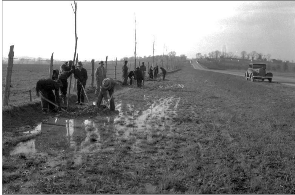
Figure 7: Bureau of Homeless Men planting trees along Henry Shaw Gardenway (Highway 50)

After the initial success, the Gardenway Association continued with their efforts, adding additional landscaping every year during the 1930s. The Association received a work group from the Civilian Conservation Corp, which did landscaping and roadside improvements, which included erosion control and roadside structures. 13