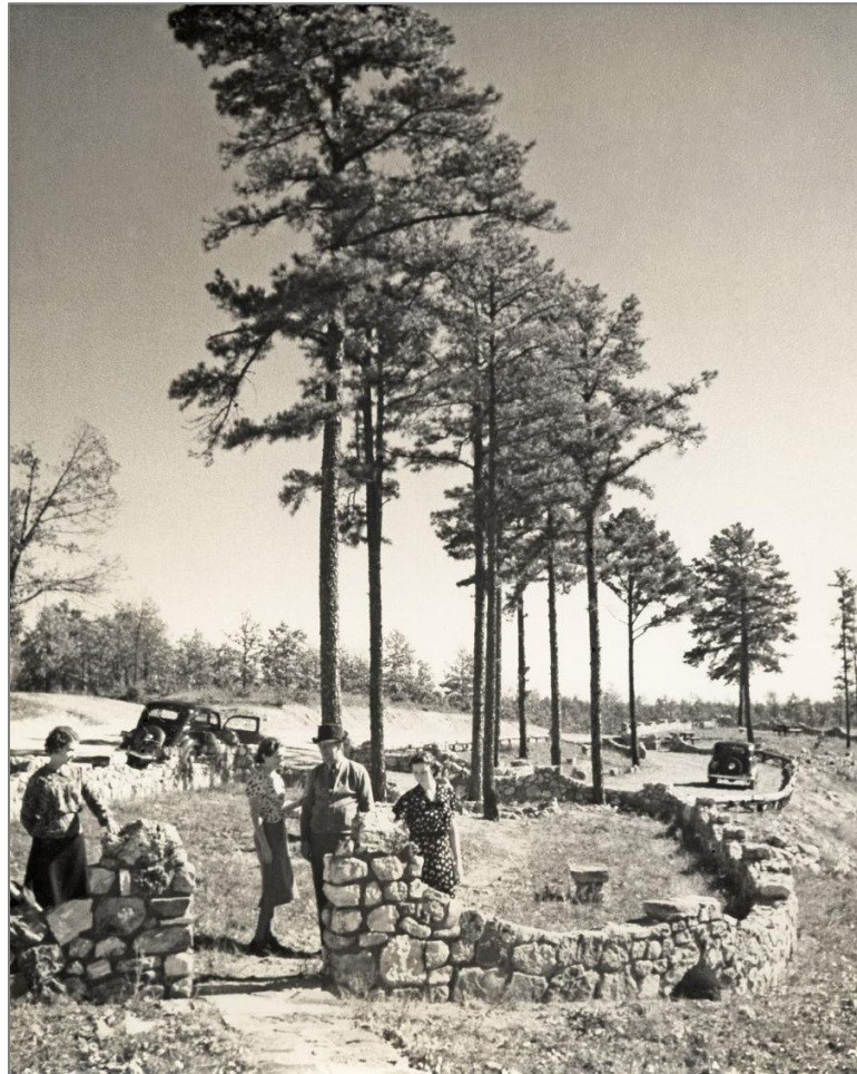
Figure 15: Stillhouse Hollow Roadside Park, Wayne County, Route 34, ca. 1936

from local sponsors; labor was supplied through Federal Work Relief Agencies, the National Park Service and the Soil Conservation Services. 30