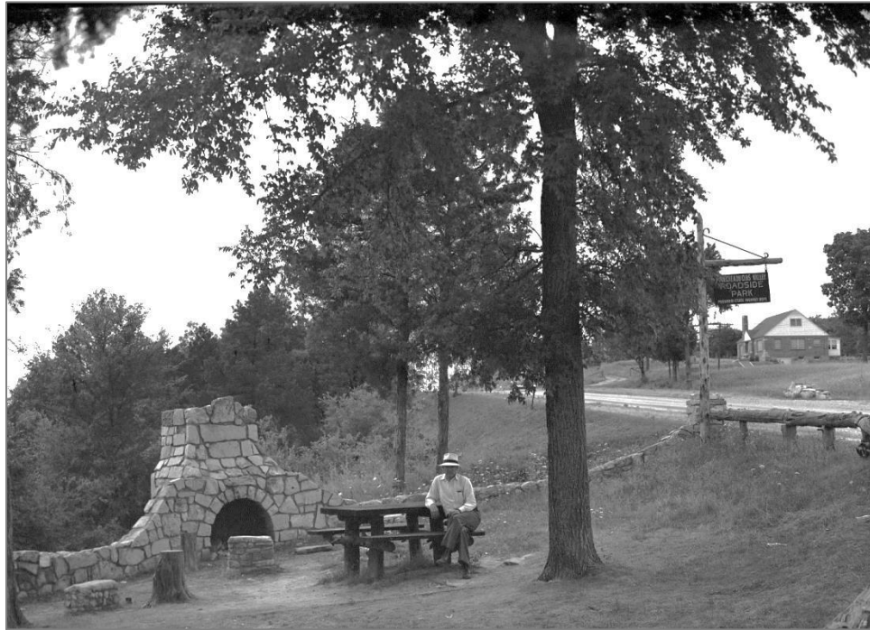
Figure 16: Forche a du Close Roadside Park, Highway 61, Ste. Genevieve County, ca. 1936

period were Spring Creek Gap in Maries County, Riverview in Crawford County, Frene Valley in Gasconade County, Tip Top in Iron County, Forche a du Close in Ste. Genevieve County, Indian Creek in McDonald County, Mahan in Shannon County, and Stillhouse Hollow in Wayne County. 33