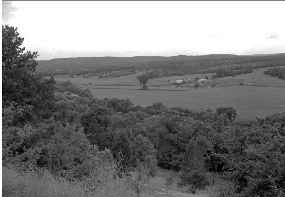
Figure 17: View from Forche a du Close Roadside Park

The roadside parks and scenic turnouts served public safety as well as beautifying the highways. They allowed tired motorists the opportunity to get out from behind the wheel, and they provided a way for motorists to enjoy views without causing traffic congestion along the roadside. 35