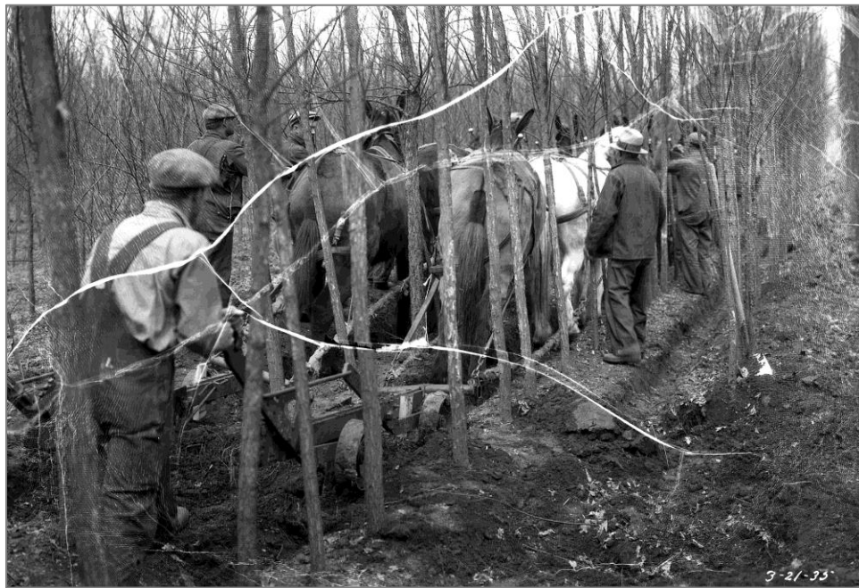
Figure 10: Digging up trees at Missouri Department of Conservation for Roadside Planting

The Highway Department spent several hundred thousand dollars annually on planting materials, with planting materials purchased from a variety of nurseries statewide. 15 These plants were used for roadside beautification efforts and for erosion control. In addition, there was a partnership with the Department of Conservation to grow trees for the use of both agencies 16 , and with the Missouri Botanical Garden to use materials grown at the Shaw Arboretum. 17 The Little River Drainage District, in southeast Missouri, allowed the Department to use trees and plants growing wild in the drainage ditches that would have to be removed to prevent the ditches from becoming clogged with debris. 18