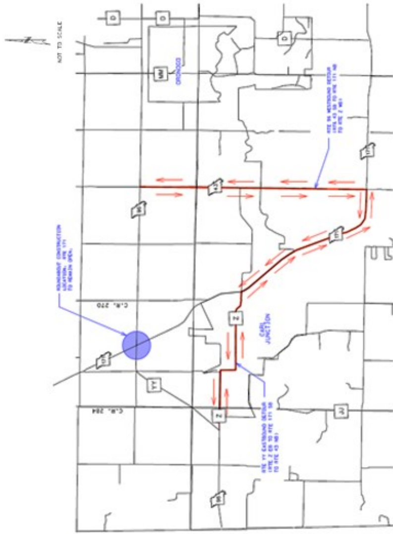
Proposed Detour Route for Route 96 / YY Closure through Intersection