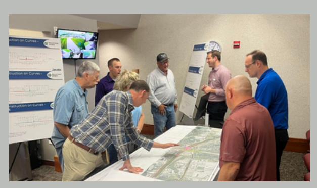
Public Hearings were held on May 1 (Columbia) and May 2 (Kingdom City) for the Columbia to Kingdom City project.

Construction is anticipated to begin this summer and should be completed by late 2027. The planned improvements from Millstone Weber and Jacobs include new concrete pavement on all three lanes of Interstate 70 in each direction for the 20-mile section between Columbia and Kingdom City, and improved interchange designs at the U.S. Route 63 and Route 54 interchanges at I-70. Additionally, throughout construction two lanes of travel will be available for both directions of I-70 during peak hours. Learn more and leave comments via the project website: <a href="https://www.modot.org/improvei70/columbiakingdomcity">www.modot.org/improvei70/columbiakingdomcity</a>.