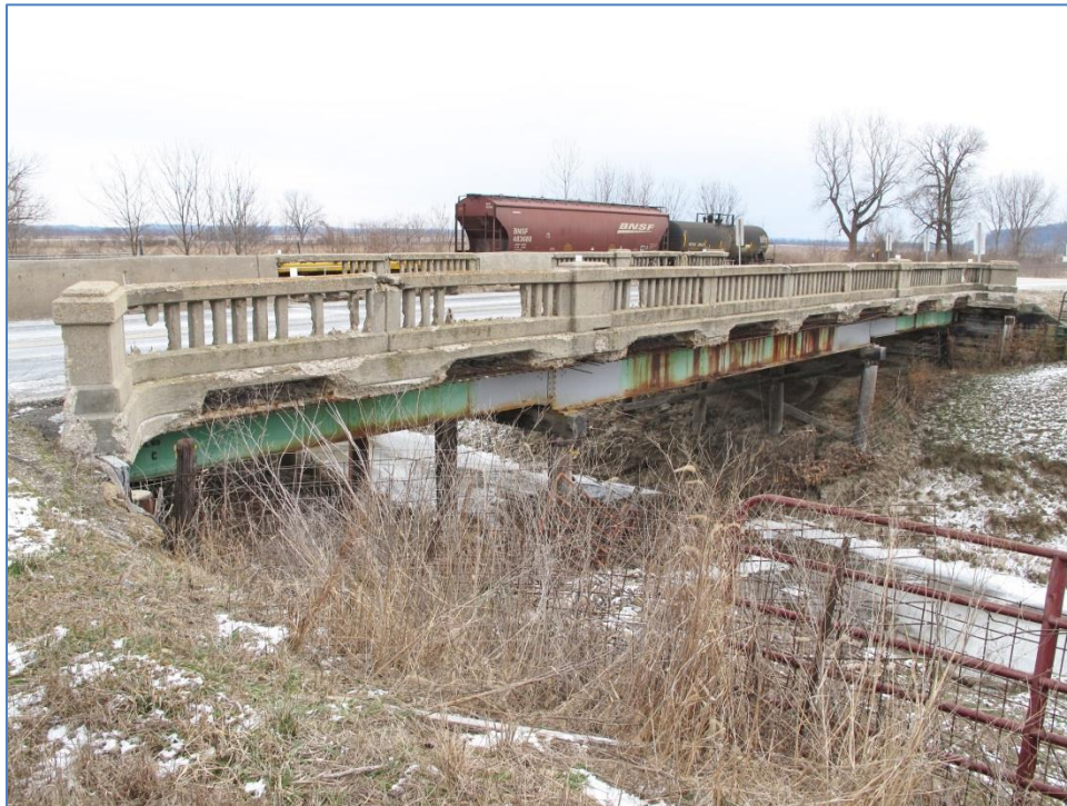
Figure 2: An exemption from marketing was granted for the Fox Creek Bridge because the bridge could not be rehabilitated within the Secretary of the Interior's Standards and because the bridge was unlikely to be relocated due to aesthetics.