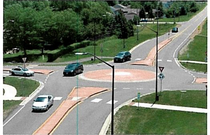
Example of a single-lane roundabout.

The modern roundabout is a type of circular intersection configuration that safely and efficiently moves traffic through an intersection. Roundabouts feature channelized approaches and a center island that results in lower speeds and fewer conflict points. At roundabouts, entering traffic yields to vehicles already circulating, leading to improved operational performance.