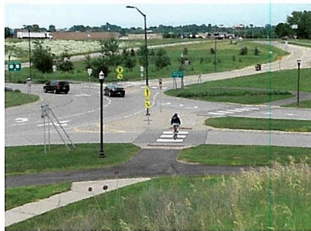
Example of a multi-lane roundabout.

Roundabouts can be implemented in both urban and rural areas under a wide range of traffic conditions. They can replace signals, two-way stop controls, and all-way stop controls. Roundabouts are an effective option for managing speed and transitioning traffic from high-speed to low-speed environments, such as freeway interchange ramp terminals, and rural intersections along high-speed roads.