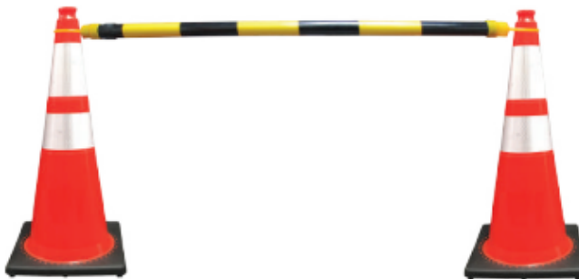
6' to 10' Retractable Cone Bar White and Orange EG Reflective Tape Extends 2' from both ends Pole Diameter - 1.5" COA-TCB-2WO