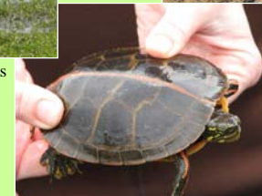
Southern Painted turtle