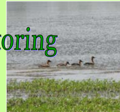
Fulvous whistling ducks